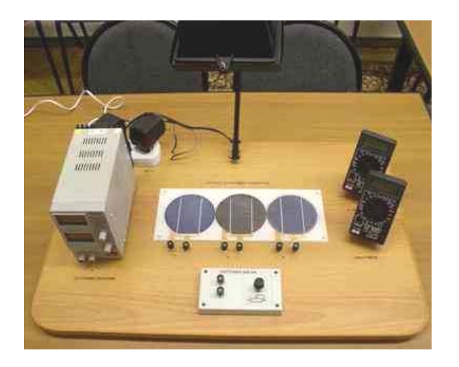
Example -PV lab test setup

Review the vocabulary words from the Reading Passage. Ask your teacher if you are unsure of any of the meanings.